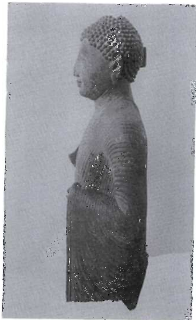
Bronze Buddha from the west coast of Celebes c. A.D. 600.