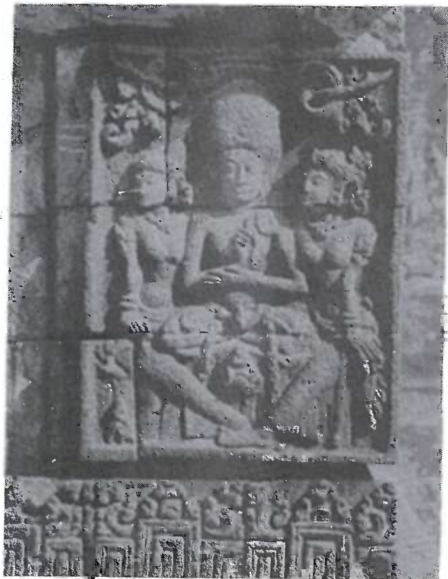
Relief from Chandi Kedaton, Kraksaan, East Java c. A.D. 1370.

The fiches with the photographs and catalogue are supplied in two sturdy plastic binders with dust cover.