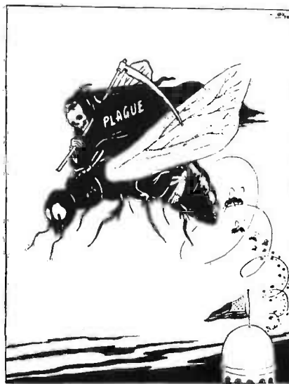
"The US imperialists regularly drop on Korea and China huge quantities of infected insects spreading germs of infectious diseases."

Report Series. 2.1964 - 2.1990. Numbers 101-766 which were published on the basis of data derived from the computer results on various issues. A complete listing of all reports on microfiche comes with the collection. 125 microfiche Order no. LR-16,099/1