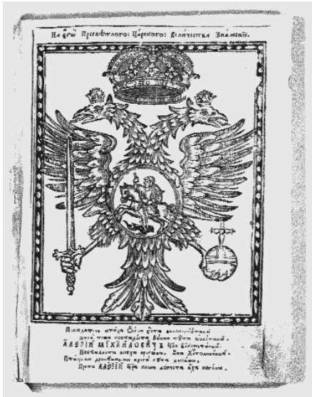
Haliatovs'kyi, Ioanykii. Mesia pravdivyi Isus Khristos syn bozhii ... Kiev, 1669.