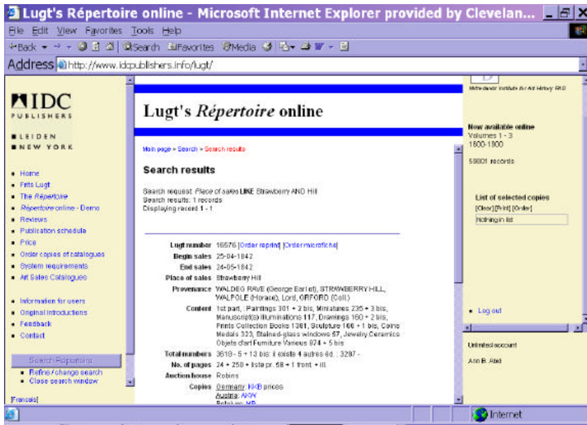
Fig. 1a. Sample record.

The electronic version includes citations to the art auction catalogues included in the print version as well as newly discovered catalogues and corrections to the original volumes. As of February 2004, nearly 60,000 records were included in the database. It can be searched in either English or French by Lugt number, date of sale, place of sale, provenance, auction house, content of sale and library holdings. Indexes for place of sale, provenance, auction house and contents include a 'browse list' option, which is especially useful for variant spellings of place names and collectors' names and language differences. Boolean searching using 'and' or 'or' is functional for all of the search fields and results can be refined by combining indexed fields. The searching structure is intuitive, making it easy to comprehend and use. However a general word index would have been a desirable additional search option.