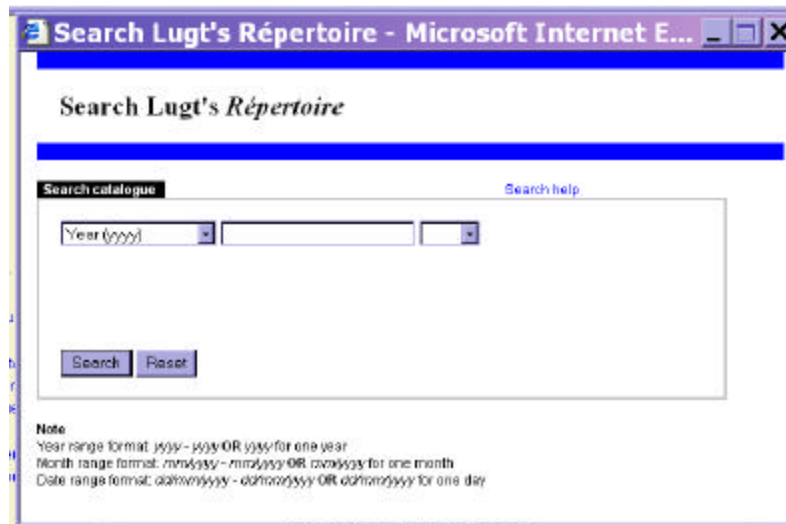
Fig. 2. Date-search screen.

The 'search help' link allows the user to access brief but clear explanations of language notes, search options and search results. Users should note that when searching by place of sale, the English version of the database uses Library of Congress name authorities, while the French version follows Lugt's original place names. Other idiosyncrasies of the database, such as the fact that provenance information has not been translated into English, are also explained in this section.